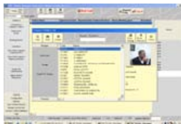
Frequent visitor list