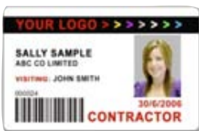
Passes on Paper and/or PVC