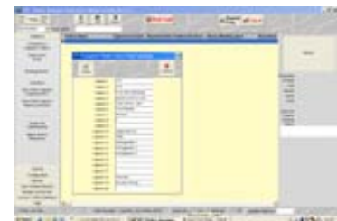
Add extra fields